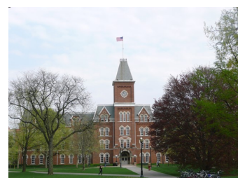
Ohio State University

If you are a self-motivated learner who enjoys meeting new people, and you would like to have a variety of experiences, a large university may be ideal.